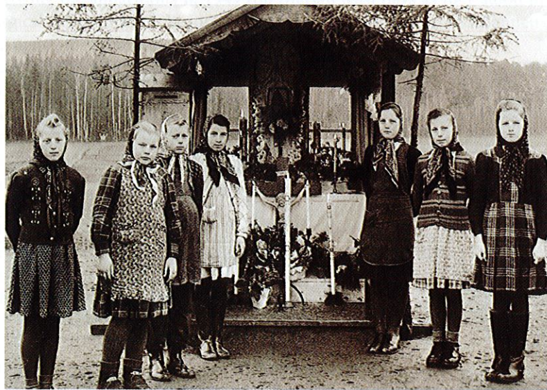
Plate 4. Heroldsbach, Bavaria, Germany: early 1950s. The seven visionaries in front of the small original chapel erected at the site.