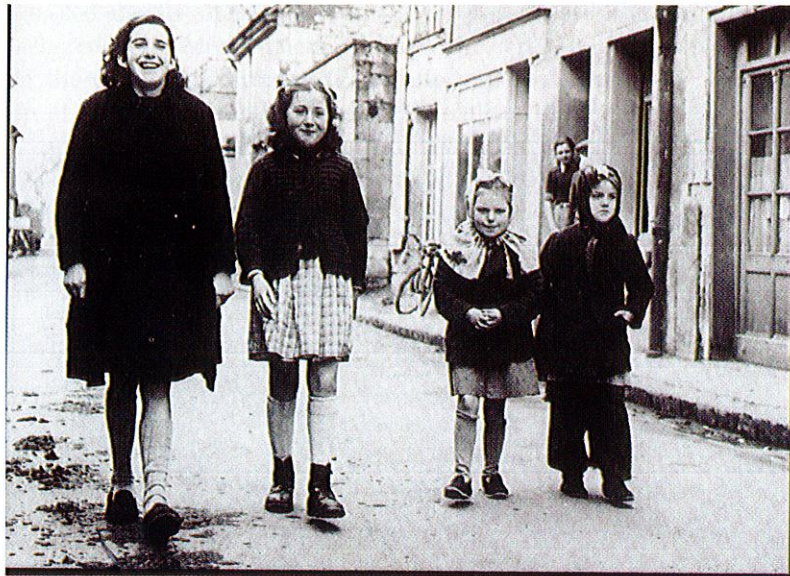
Plate 3. L'île-Bouchard, Centre, France: December 1947. The child visionaries.