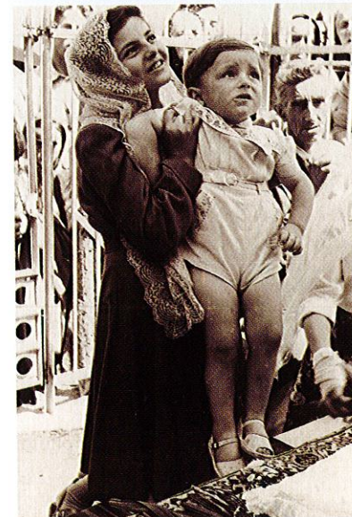
Plate 7. Heroldsbach, Bavaria, Germany: early 1950s. Visionaries enact the carrying of the Christ Child in their arms (with permission: Pilgerverein Heroldsbach e.V.).